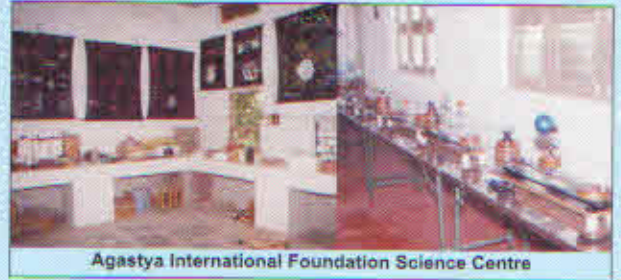
Agastya International Foundation Science Centre